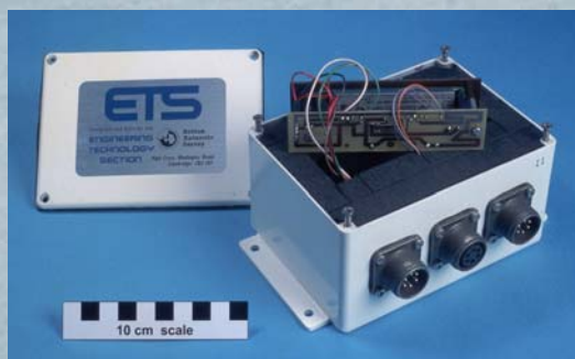
DSC Junction Box