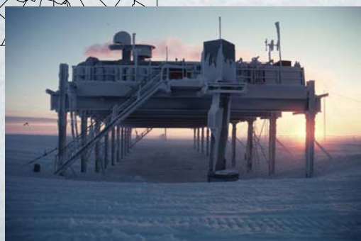
Halley V base

The British Antarctic Survey's Halley base is built on a floating ice shelf. The accommodation building is constructed on a steel platform above the ice. Differential movement of the ice shelf causes uneven displacement of the legs supporting the platform, which could cause permanent structural damage. Adjustments are made using steel cables to tension each leg in relation to the others. Consequently monitoring this movement is crucial to the success of this process. A system, developed by BAS engineers provides real-time data and analysis using a network of load cells linked to a logging system. Using this information, the on site structural engineer is able to make informed decisions with regard to adjustments.