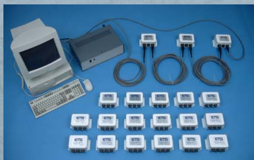
Platform Monitoring System