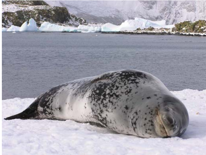
A snoozing beast