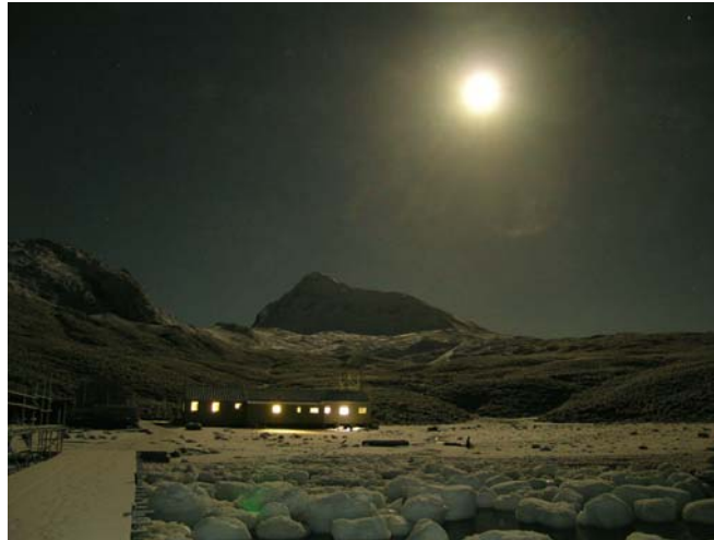
Full moon over the base

The month began with a beautifully calm and clear night with a full moon. Nights like this are so few and far between you simply have to make the most of them. Zac and I decided to go for a moonlit walk to the top of Tonk Ridge.